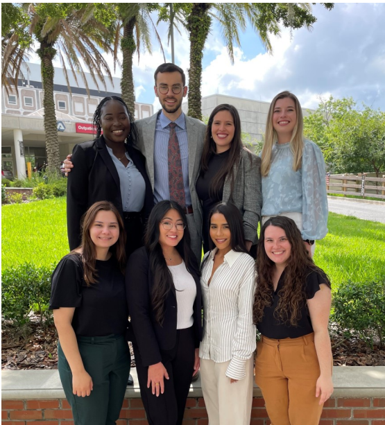
2024-2025 PGY1 Residents

At North Florida/South Georgia Veterans Health System (NF/SG VHS), we prepare postgraduate year one (PGY1) residents to step into clinical pharmacist roles where they are responsible for medication-related care for patients with a wide range of diseases and have the option of pursuing a postgraduate year two (PGY2) residency in a focused area. Our large medical system and program flexibility are assets to a resident that is looking to be well rounded or to prepare for a specific VA position following residency. We would love to meet you and talk more about how we can help you meet your clinical pharmacist goals after training in the sunshine state!