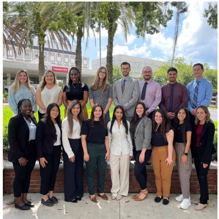
2024-2025 Pharmacy Residents and Fellow

For more information about our pharmacy residency programs, visit our website