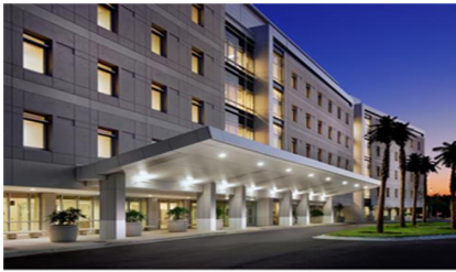
Malcom Randall VAMC

The residency program participates in the National Matching System and PhORCAS for the application process.