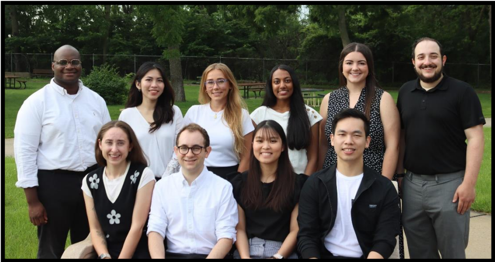
PGY-1 and PGY-2 residents