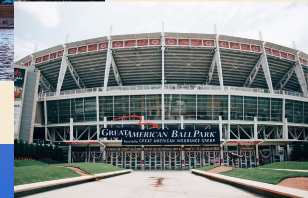
Home of the Cincinnati Reds