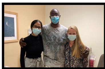
Pharmacist, Resident & Veteran in Clinic

Ensure to include in application package all information that demonstrates involvement in projects, presentations that you find valuable for our reviewing committee