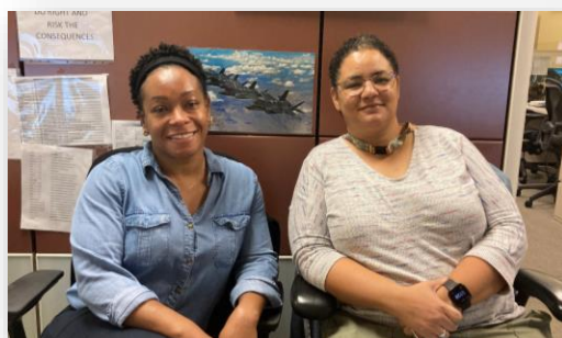
Pharmacy Medical Scheduling Assistants

PACT Clinic/Pharmacy Comprehensive Medication Management (CMM) - The resident will work daily for one month in the CMM clinic providing patient care in clinic or through virtual care appointments. The rotation will focus on the chronic disease state management of common chronic disease states including hypertension, hyperlipidemia, diabetes, tobacco cessation, hypothyroidism, and COPD. CMM occurs within the clinical pharmacist practitioner's (CPP) assigned PACT team. CPPs function as a licensed independent practitioner under a scope of practice with prescriptive authority allowing for the ability to initiate, adjust, discontinue, and monitor medications. The CPP scope of practice is constantly evolving based on the needs of their PACT team and Veteran care needs. Residents will also be exposed to medication reconciliation, polypharmacy reviews and epoetin monitoring within the CMM clinic. After one month, the rotation is continued longitudinally for up to one day per week through the remainder of the year. During the second half of the year, the goal is for the resident to function more independently and serve as the pharmacist for one PACT teamlet for drug information questions and any additional assistance that may be needed.