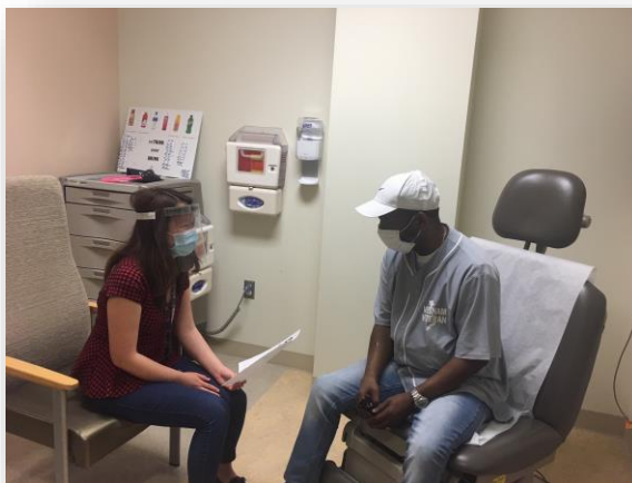
Pharmacy Resident Interviewing a Veteran

Oncology – Residents may have the opportunity to work with the oncology CPP who works with the VA oncologist to develop oncology treatment plans, manage oral chemotherapy regimens, and participate in the PHASER project.