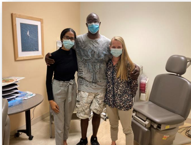
Resident, Veteran & Pharmacist

PACT Clinic/Pharmacy Comprehensive Medication Management (CMM) - The resident will work daily for one month in the CMM clinic providing patient care in clinic or through virtual care appointments. The rotation will focus on the chronic disease state management of common chronic disease states including hypertension, hyperlipidemia, diabetes, tobacco cessation, hypothyroidism, and COPD. CMM occurs within the clinical pharmacist practitioner's (CPP) assigned PACT team. CPPs function as a licensed independent practitioner under a scope of practice with prescriptive authority allowing for the ability to initiate, adjust, discontinue, and monitor medications. The CPP scope of practice is constantly evolving based on the needs of their PACT team and Veteran care needs. Residents will also be exposed to medication reconciliation, polypharmacy reviews and epoetin monitoring within the CMM clinic. After one month, the rotation is continued longitudinally for up to one day per week through the remainder of the year. During the second half of the year, the goal is for the resident to function more independently and serve as the pharmacist for one PACT teamlet for drug information questions and any additional assistance that may be needed.