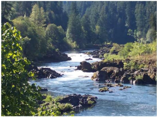
The North Umpqua River in Roseburg, Oregon