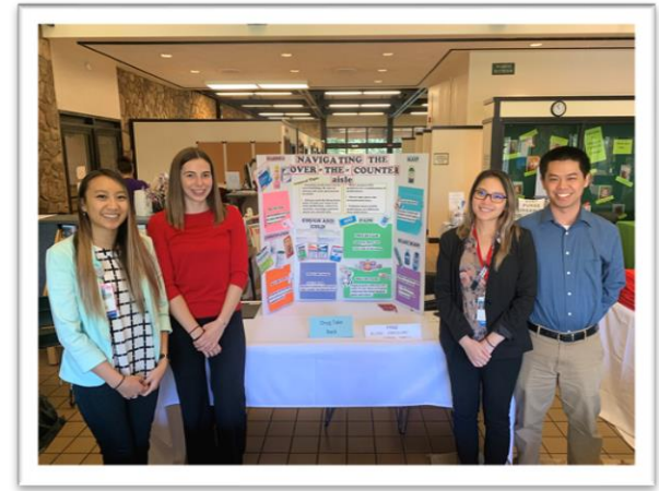
Roseburg VA Health Care System PGY-1 residents and the Eugene VA Health Care Center PGY-2 resident at the Umpqua Community College Conference on Extraordinary Living